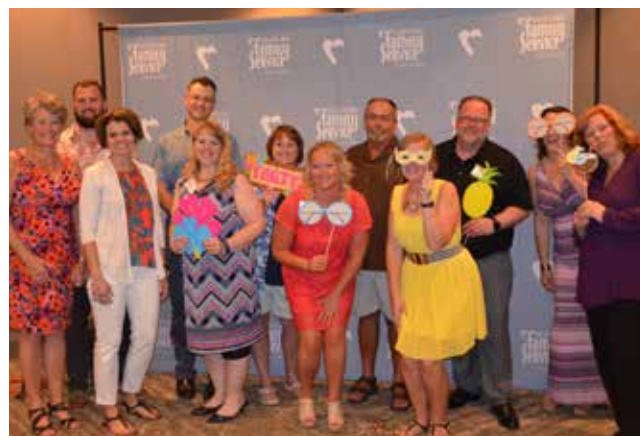
Members of the Southwest Iowa Advisory Committee pose with fun props during the event at our photo booth.